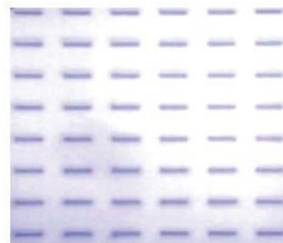
Protein sample transfer to NC membrane