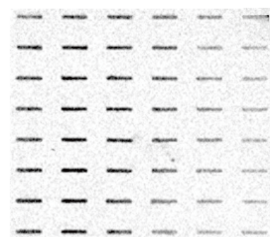
Western Blot of serial diluted protein samples transfer to NC membrane